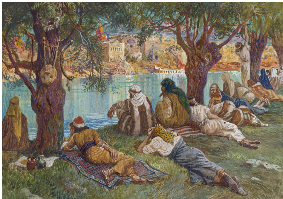
"By the Waters of Babylon" - James Tissot (1836-1902)

The original hymn tune on which these two pieces are based was written in 1525. Zachow was a German musician and composer of vocal and keyboard music. Much of his music was criticised as being too complicated and long! He is most famous for having been the first music teacher of the young George Friederich Handel. Bach is perhaps the most famous composer of organ music and was also an outstanding organist who harmonised many of the melodies used in the church at that time.